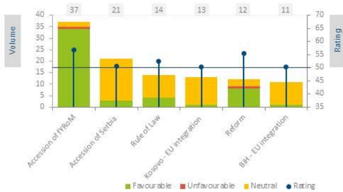
ELARG: Leading Daily Issues by volume, favourability & rating