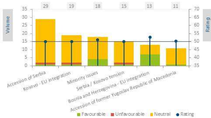
ELARG: Leading Daily Issues by volume, favourability & rating