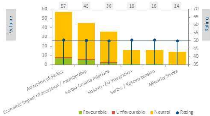
ELARG: Leading Daily Issues by volume, favourability & rating