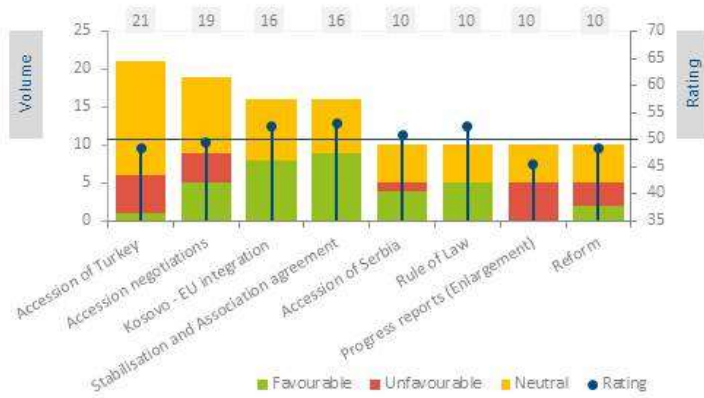
ELARG: Leading Daily Issues by volume, favourability & rating