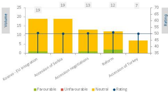
ELARG: Leading Daily Issues by volume, favourability & rating