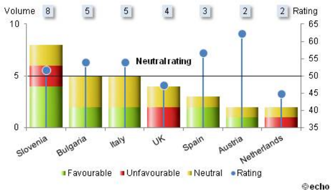
ELARG: Leading Daily Countries by volume, favourability & rating